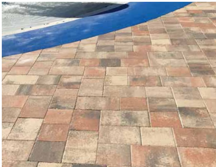
Traverstone in Cream / Orange / Pewter, Random Pattern