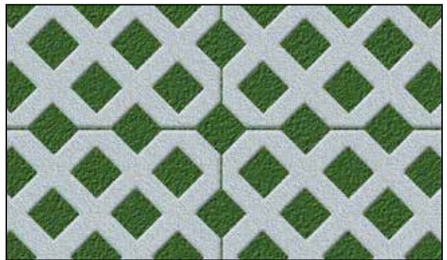
45° Straight Stack

The Flagstone Diamond Turf Block provides an environmentally sound alternative to solid paved surfaces. Our open grid design allows water and nutrients to penetrate the soil, feeding the ground and tree roots below. While this design is ideal for soil retention on sloped areas such as pond and lake banks, it is commonly used in wooded and natural landscape settings for both residential and commercial applications. Because of its unique and high tensile strength design it is the most durable block of its kind.