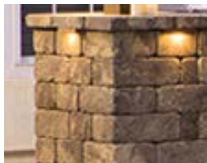
Same image at low-resolution is not clear and starts to pixelate.