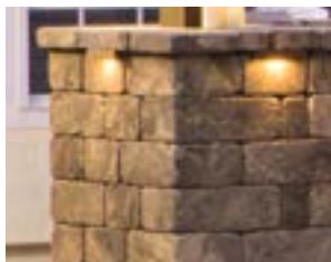
Image in high resolution is nice and clear.

Take a variety of shots and photograph your project from multiple angles. We may use multiple shots per project.