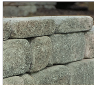
6. Capping the Wall

Place the shouldered fiberglass pins into the holes of the Units (note: place one pin only per each grouping of three holes). Place pins in the middle hole for near vertical alignment or the holes nearest the embankment for a 9.5° +/- batter per course. According to wall requirements and design, the front pin hole (towards the face of the wall) can be used randomly to allow a forward projection of a specific unit for accent and variation in the wall appearance.