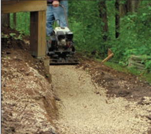
1. Prepare Base Leveling Pad

Remove all surface vegetation and debris. Do not use this material as backfill. After selecting the location and length of the wall, excavate the base trench to the designed width and depth (min. 20" w x 12" d). Start the leveling pad at the lowest elevation along wall alignment. Step up in 6" increments with the base as required at elevation changes in the foundation. Level the prepared base with 6" of well-compacted granular fill (gravel, road base, or 1/2" to 3/4" crushed stone). Compact to 95% Standard Proctor or greater. Do not use PEA GRAVEL or SAND for leveling pad.