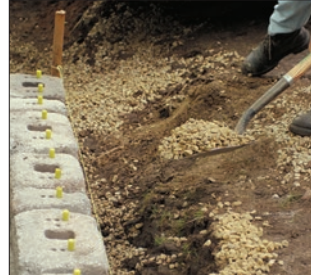
4. Install Fill & Compaction

Remove all surface vegetation and debris. Do not use this material as backfill. After selecting the location and length of the wall, excavate the base trench to the designed width and depth (min. 20" w x 12" d). Start the leveling pad at the lowest elevation along wall alignment. Step up in 6" increments with the base as required at elevation changes in the foundation. Level the prepared base with 6" of well-compacted granular fill (gravel, road base, or 1/2" to 3/4" crushed stone). Compact to 95% Standard Proctor or greater. Do not use PEA GRAVEL or SAND for leveling pad.