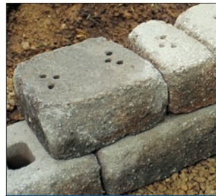
5. Install Additional Courses

Place the first course of units end to end (with front corners touching) on the prepared base. The long groove (receiving channel) on the unit should be placed down and the three pin holes should face up, as shown. Make sure each unit is level - side to side and front to back. Leveling the first course is critical for accurate and acceptable results. For alignment of straight walls, use a string line aligned on the unit pin holes for accuracy. Minimum embedment of base course is 6" below grade.