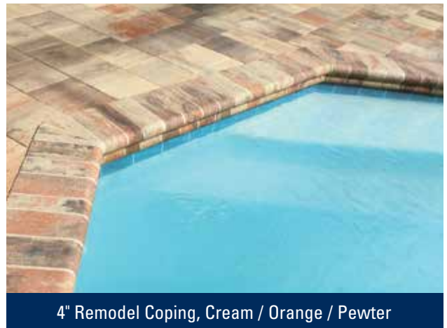
4" Remodel Coping, Cream / Orange / Pewter