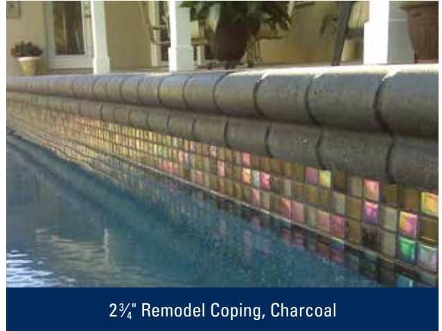
2 3/4" Remodel Coping, Charcoal

Use for pool coping or step coping to overlay existing hard surfaces.