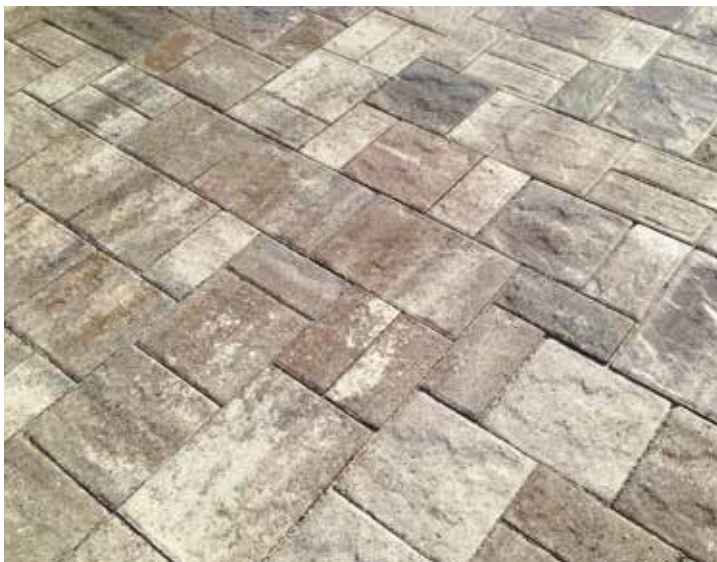
Heritage in White / Tan / Charcoal, Random Pattern

This product has no chamfer. Handle with care when installing!