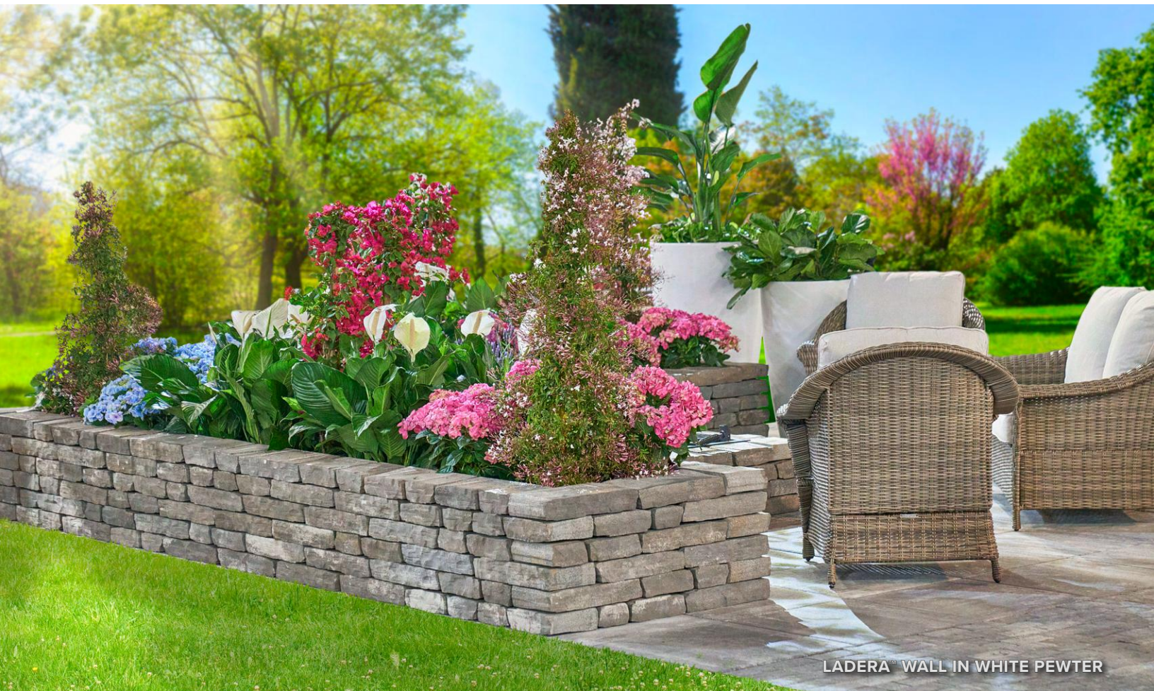
LADERA™ WALL IN WHITE PEWTER