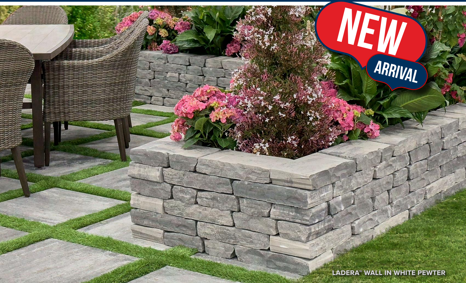
LADERA™ WALL IN WHITE PEWTER

FLAGSTONE PAVERS™ QUALITY & STRENGTH INTERLOCKED